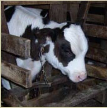
Old Way: Tethered and Crated calf